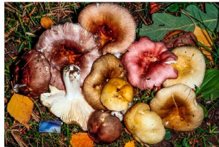
Russula subclariana – Quercus-Tilia-Castanea-Russula-graeuolens -Gruppe. Die neue Art liegt in der Untersektion Violaceinae intermediär zwischen R. clariana und R. violacea ( R. pelargonica ).