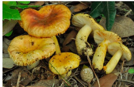
Russula messapica – Mediterrane Russula vinosobrunea -Gruppe. Foto Luciano MICHELIN; seltene und auffallend gelbende Art. Epikutisstruktur mit sehr kompliziertem Aufbau.